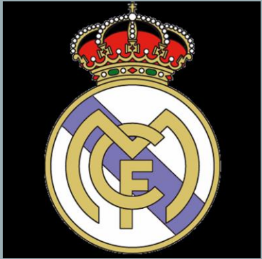
FC Barcelona Athlético Madrid Real Madrid