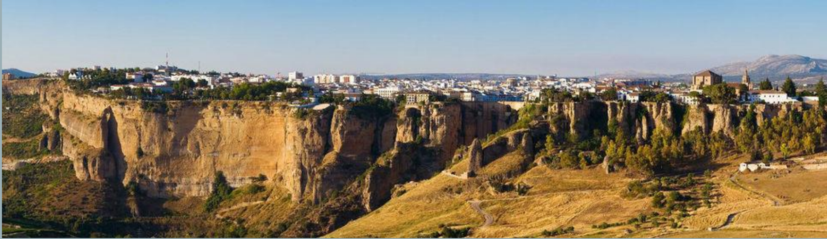
Ronda la ciudad